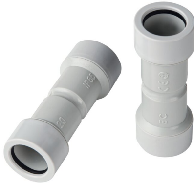
IMMAGINE RAPPRESENTATIVA REPRESENTATIVE IMAGE

Conduits and fittings > Accessories and fittings > Joints and fittings > Speed system - ip65 fittings > Joint conduit - conduit