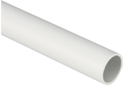
IMMAGINE RAPPRESENTATIVA REPRESENTATIVE IMAGE

Conduits and fittings > Conduits > Rigid conduits > Series tg21 - pp - class 33421 - 750 n > plastic conduits > 3 meters - lenght