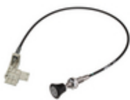
Mechanical remote control