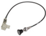
Mechanical remote control